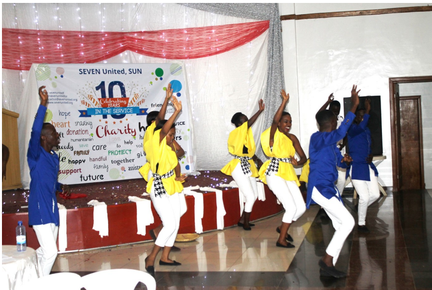
Shining Stars Performance